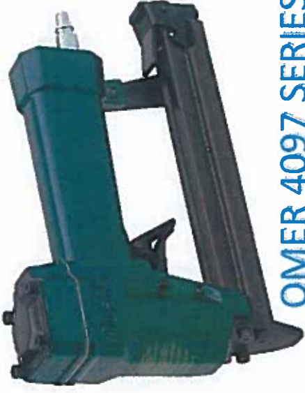
OMER 4097 SERIES