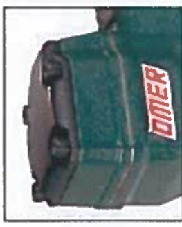
VERSION H – H MODEL