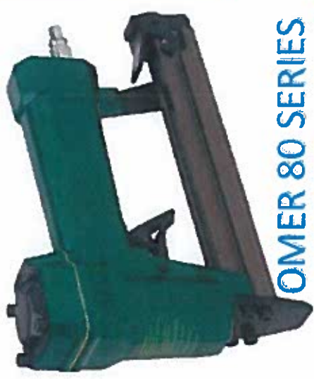
OMER 80 SERIES