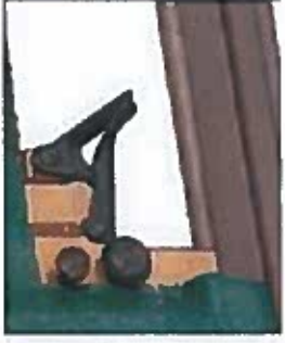
VERSION V – V MODEL