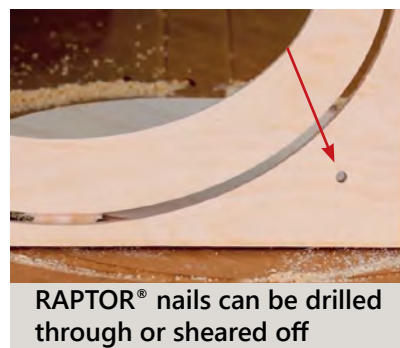
RAPTOR® nails can be drilled through or sheared off

RAPTOR® composite nails can be removed by post drilling them through or by simply tapping the board material laterally to shear at the interface.