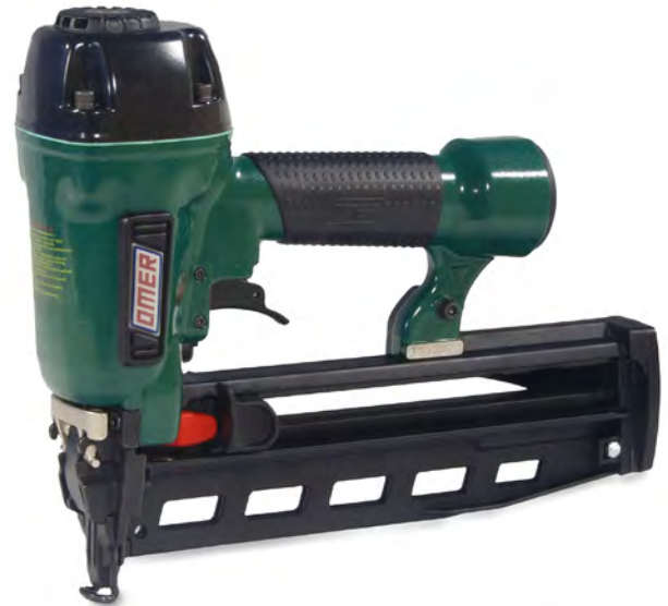
OMER B17P.763 Finish Nailer

Packaging: 2350 nails per box • 16 boxes per case