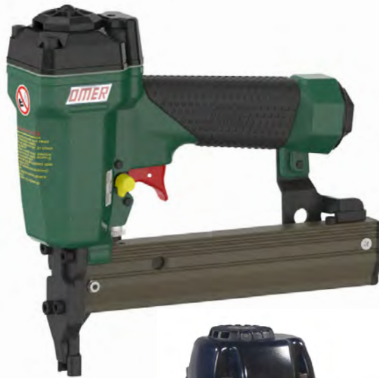
OMER 17P.32 Finish Nailer