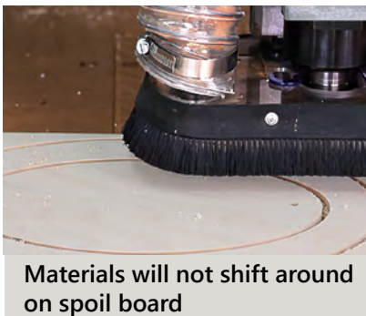
Materials will not shift around on spoil board

RAPTOR® composite nails secure smaller millwork pieces to the spoilboard that the vacuum table cannot hold.