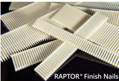
RAPTOR® Finish Nails